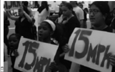
Parents and students from CCB in the Bronx rally for 15 mph slow speed zones around their schools. Their cries have fallen on deaf ears at DOT.

In February 2004, with another influx of $4 million in federal support, the DOT again announced Safe Routes to School, announcing they would "start making safety improvements" at 135 "priority schools" "by the end of the current school year." Again, Transportation Alternatives and local parents were optimistic that the institutionalization and funding of this Safe Routes program reflected a new set of people-first priorities at DOT and would yield real changes to the street environment. We should have known better.